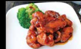
30. General Tso's Chicken 左宗鸡 15.75