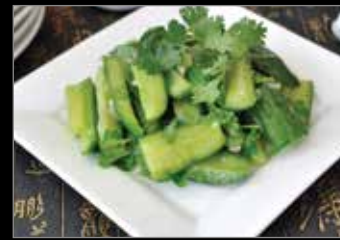
27. Cucumber Salad 凉拌黄瓜 8.75