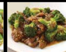
35. Beef With Broccoli 芥蓝牛 15.75