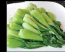
39. Sautéed Baby Bok Choy W Garlic 清炒上海菜 13.75