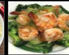
38. Jumbo Shrimp With Ginger & Scallion Sauce 姜葱大虾 18.25