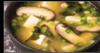
25. Miso Soup 3.95 味噌汤