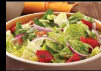
29. Garden Salad With Ginger Dressing 田园沙拉 4.95