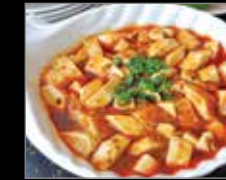
40. Mapo Tofu 麻婆豆腐 13.75