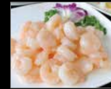
36. Stir Fried Baby Shrimp 清炒虾仁 16.75