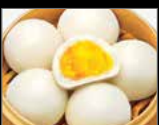
22. Lava Bun(2) 奶黄包 8.50