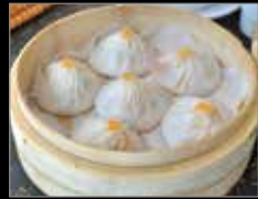
2. ★ Steam Crab Meat & Pork Soup Dumpling(6) 蟹粉小笼包 9.95