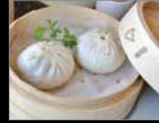
23. Vegetable Bun & Mushroom(2) 香菇菜包 8.50