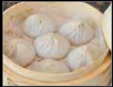
1. ★ Steam Pork Soup Dumpling (6) 鲜肉小笼包 9.25