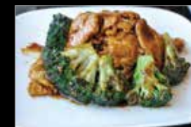
32. Chicken W Broccoli 芥蓝鸡 14.75