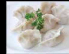
9. Boil Shrimp & Pork Dumpling(6) 水煮三鲜水饺 9.25