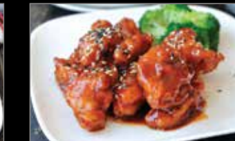
31. Sesame Chicken 芝麻鸡 15.75