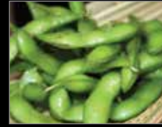
19. Edamame 海盐毛豆 5.95