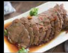
21. Spiced Beef Shank 五香牛腱 13.95