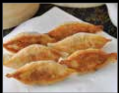
4. ★ Pan Fried Veg & Pork Dumpling(6) 菜肉锅贴 9.95