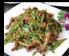
33. Shredded Beef W Pepper 小辣牛肉丝 16.75