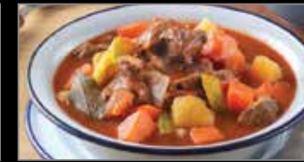
36. Borscht Soup 5.95 罗宋汤