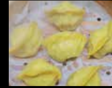
6. ★ Chicken Dumpling(6) 鸡肉饺 9.25