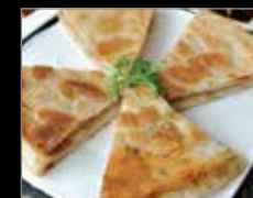
12. ★ Scallion Pancake 葱油饼 5.95