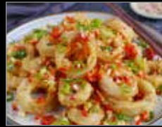
18. Salt & Pepper Squid 椒盐鱿鱼 14.00