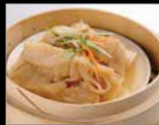
20. Steam Beef Tripes 蒸牛百叶 9.25