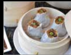
8. Sticky Rice Shumai(4) 糯米烧麦 8.50