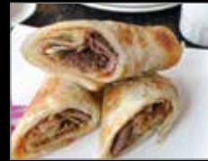
13. Pancake With Sliced Beef 牛肉夹饼 9.75