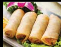
11. Veg Spring Roll S(2)/L(4) 春卷 6.75/8.25