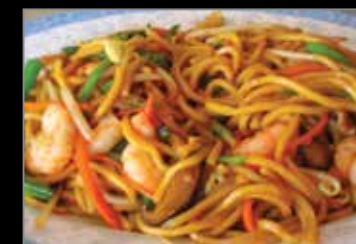
47. Beef Lo Mein 牛肉炒捞面 13.75