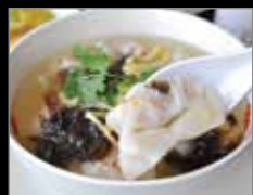
10. Shepherd Purse Wonton Soup 芥菜馄饨 10.50