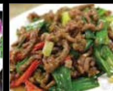
34. Shredded Beef Scallion 葱爆牛肉 16.75