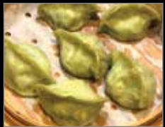
7. Vegetable Dumpling(6) 菜饺 9.50