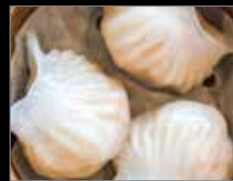
5. Shrimp Dumpling(6) 虾饺 10.25