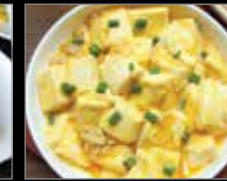
37. Totu With Crab Meat 蟹粉豆腐 16.75