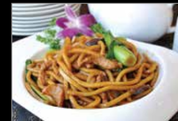
41. Fried Udon W Chicken 鸡肉炒乌冬 12.75