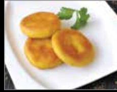
24. Pumpkin Mochi Cake(3) 南瓜饼 6.75