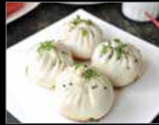
3. ★ Pan Fried Pork Buns(4) 生煎包 10.50